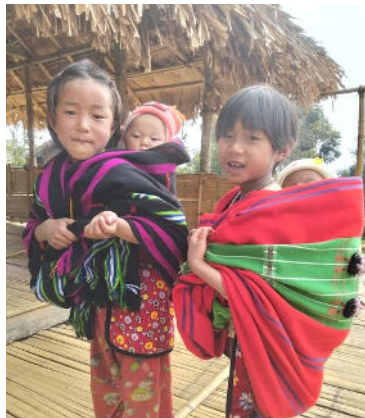
The children who are looking after the babies