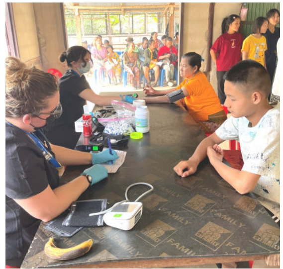
Nu Poe refugee camp