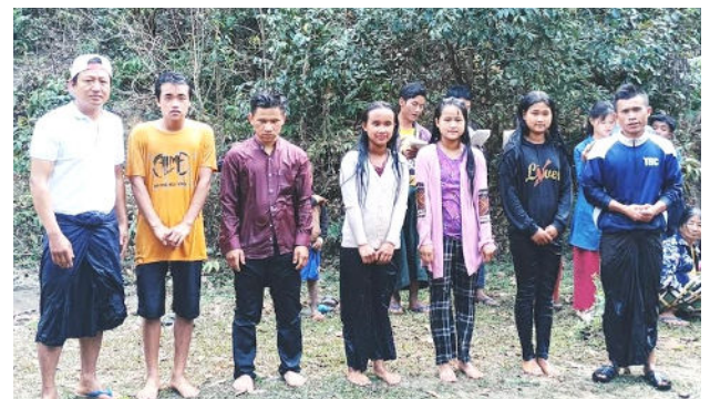
New Brothers and Sisters in Christ