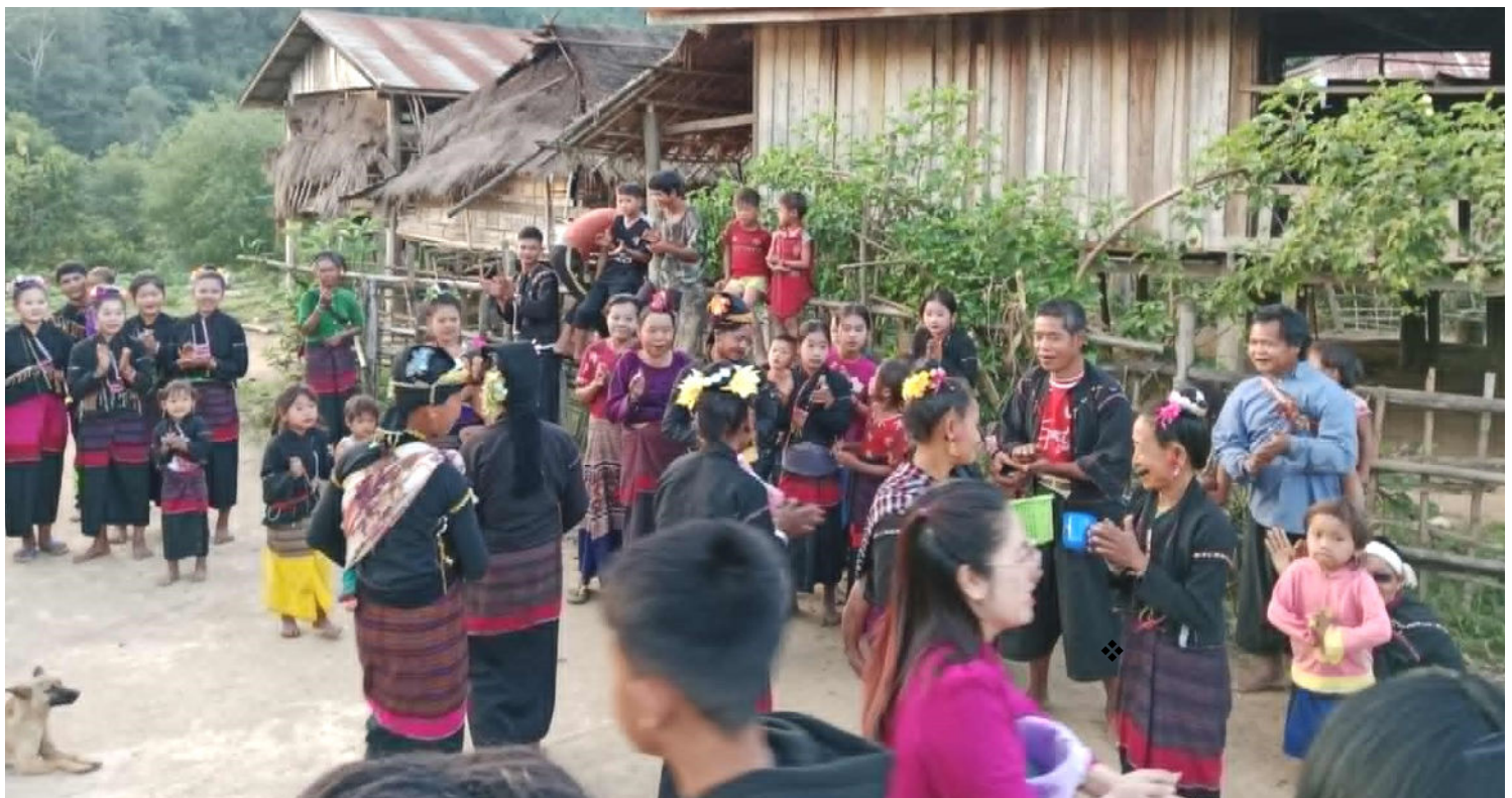
An Ann Tribe Village Celebration