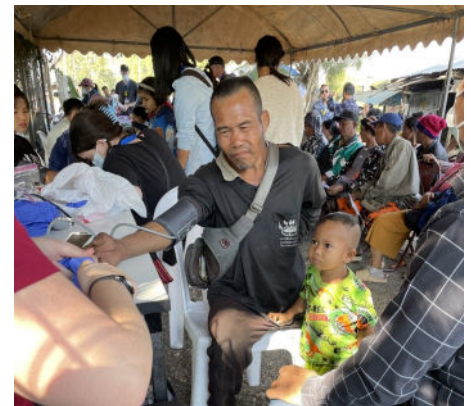
Medical Care For Refugees