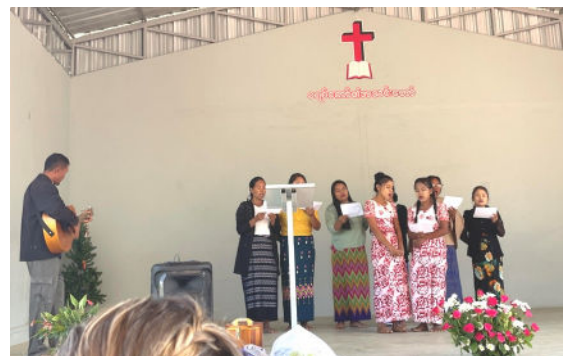
Church at Emmaus Refugee Village

"These refugees are almost exclusively Buddhist. But as they cross the border with nothing, and are met with love, kindness, provisions and protection, they are introduced to Jesus. Many open their hearts and are becoming baptized Christians."