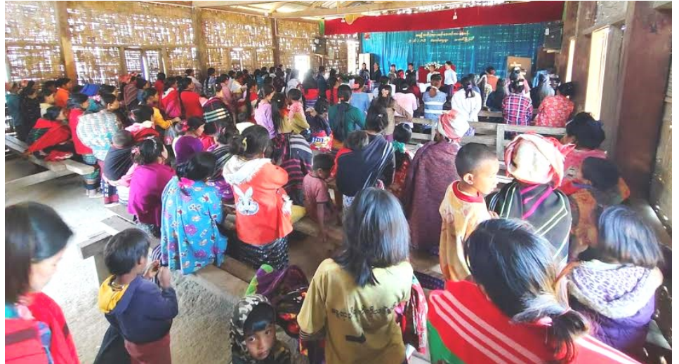
The Naga Christian Women's Seminar