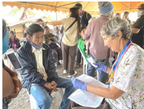
Discussing needs with nurse