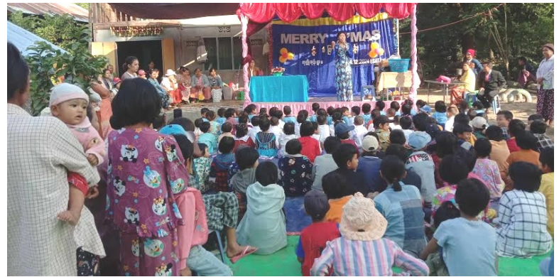
Buddhist Parents Attending Outreach