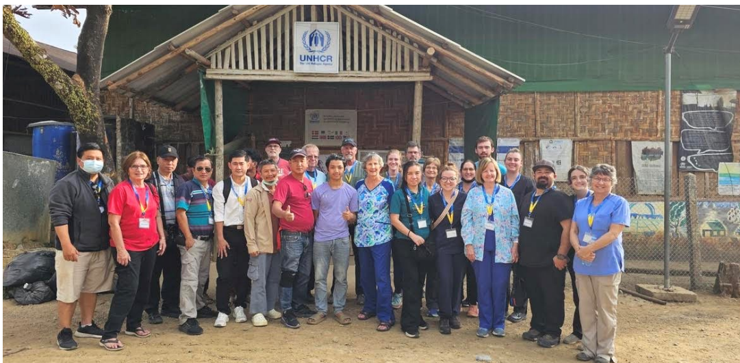
Medical Team/USA and Asia