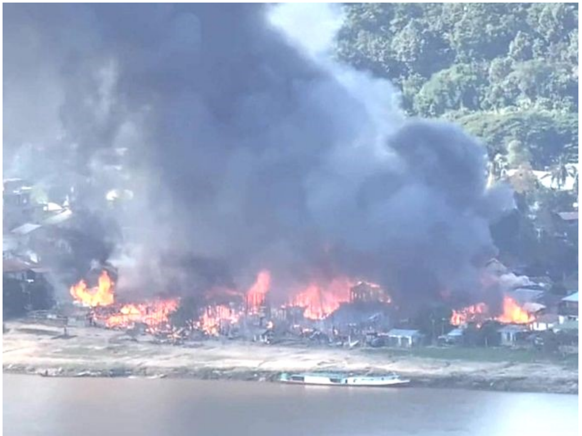
A town burning after an air strike

The Military government (Tatmadaw) continues a relentless fight against the peoples of Myanmar. The Tatmadaw is fighting its own tribe, the Burmans, plus the 152 other tribes. Their soldiers are waning, from being killed and from desertion, so the military is fighting with more airstrikes using jets they bought from Russia and China. They also are now forcefully conscripting people off the streets, 18-35 years old, men and women, to fight as front-line soldiers. Many of the tribes have formed armed militias to defend their people against the military. Now some lifetime tribal enemies are joining forces to fight back. This coalition is now called the Peoples Defense Force.