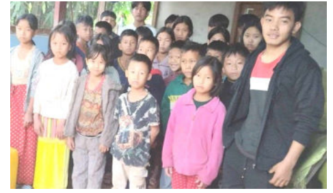
Sunday school teacher and children