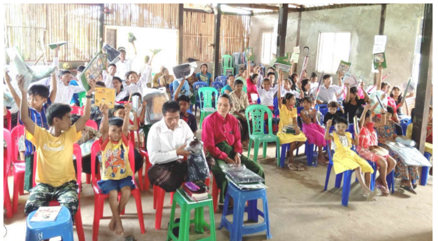
Sharing School Supplies

ACS has started nine preschools and 2 schools. We recently supplied stationary to supplement the teaching supplies. The children were very excited as they rarely get new supplies. Many of the children are from Buddhist families and this is a wonderful bridge to share the gospel.