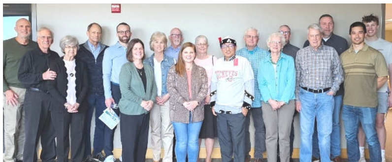
The Worthington CC Mission Team

He spent two days interreacting with the ACS Board of Directors. He visited his supporting church, Worthington Christian Church in Columbus, Ohio, and greeted the congregation at three morning services, and then conferred with the mission team. Next, he gave a conclusive report to the leaders of USAID in