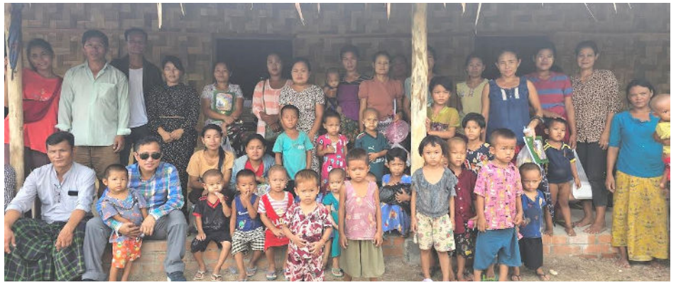
Residents at Mount Olive iDP Camp