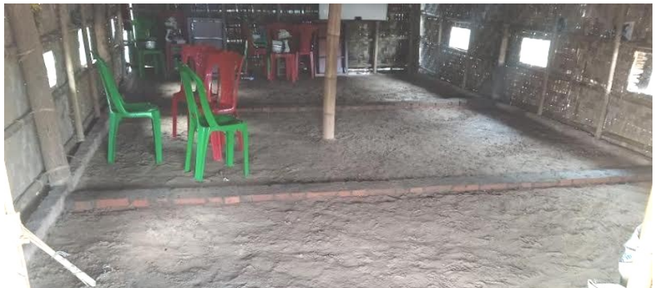
Church under Construction at Mount Olive