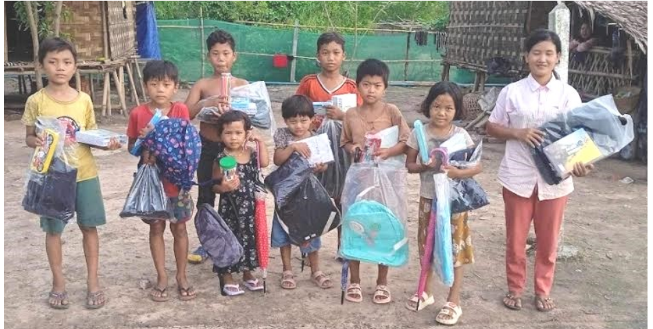
New Residents to Mount Olive Camp