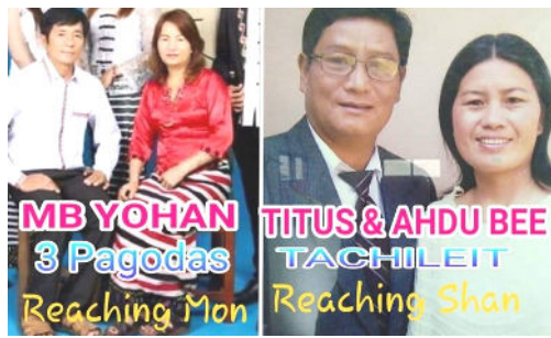
MB YOHAN 3 Pagodas Reaching Mon TITUS & AHDU BEE TACHILEIT Reaching Shan