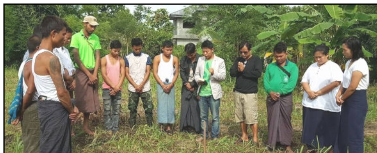
Grace Village Site Dedication

Before you read this newsletter, I will have returned from Myanmar on a trip to dedicate the first Church/Preschool building and commission the first workers in this new partnership with STADIA. The accompanying photos show the progress of the construction from the ground dedication until it was 80% finished at the time of this printing. It will be finished when I arrive for the dedication on October 7. In this newsletter we will introduce the new Grace Village team. At this moment, there are 17 in the core of the new church. Most of them are new believers from this community. The preschool has enrolled 20 children who are meeting in a facility next to the new building. This is the beginning.