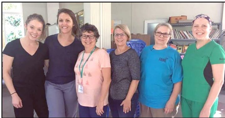
FAME Team September

partnerships! Recently FAME brought a team of Medical workers who inserted themselves into an area of medically needy to plant the seeds of the gospel. Their effort began the impetus of some new church plants. This is important pioneer work that we as outsiders can do to encourage the indigenous evangelists. Thank you FAME! Good Job!