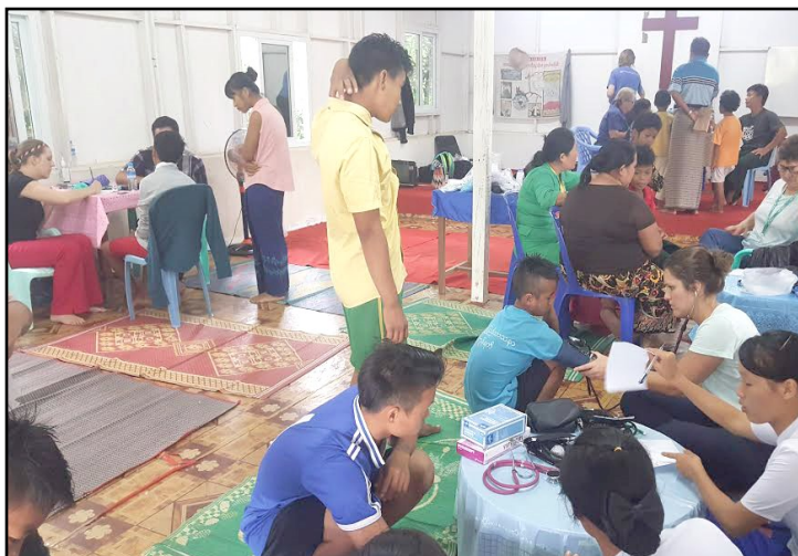
Mission Medical Clinic

The Team started by Prayer and gave them medical treatment and praying for each patient. Most of them are Buddhists. While they were waiting, I shared the Good