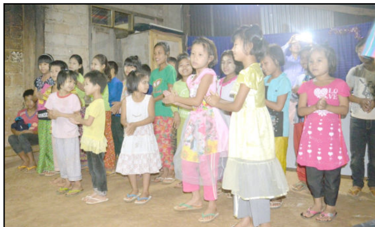
The present Maing Hsu House Church

The need of having a new church building at Maing Hsu is real. So, I am just sharing the real need with you and ACS. It is also a fruit of the children ministry at Maing Hsu. I wrote this that you may know the Maing Hsu House Church is a house church of the Lisu refugees. Between 2015 and