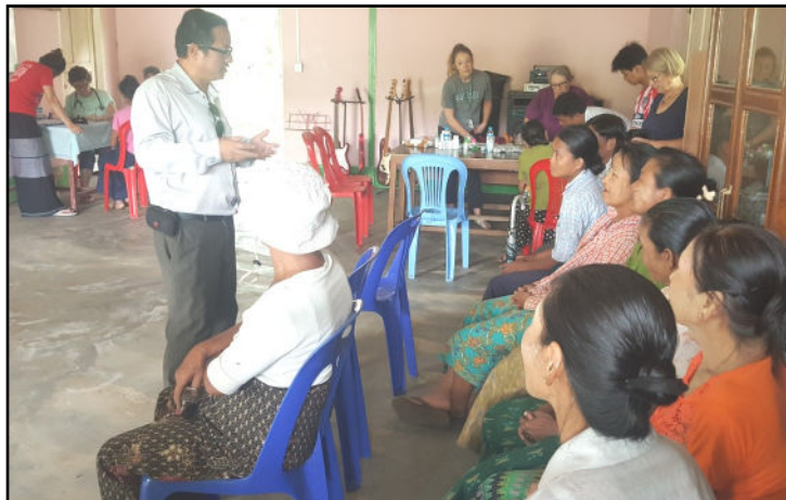
Presenting the Gospel

I would like to invite you to visit Myanmar to serve our God together by Love Action. Let God's Kingdom be expanded and His Mighty Name is Glorified Forever and Ever. Amen!