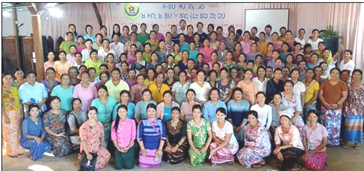
Ruth and the Women