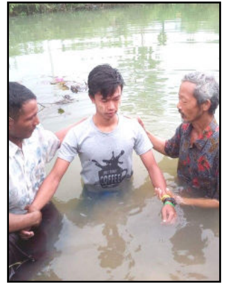
Baptizing New Converts

After sharing the Gospel, some started to believe and accepted Jesus as their personal Savior. We baptized them and planted a new church at a rented home.