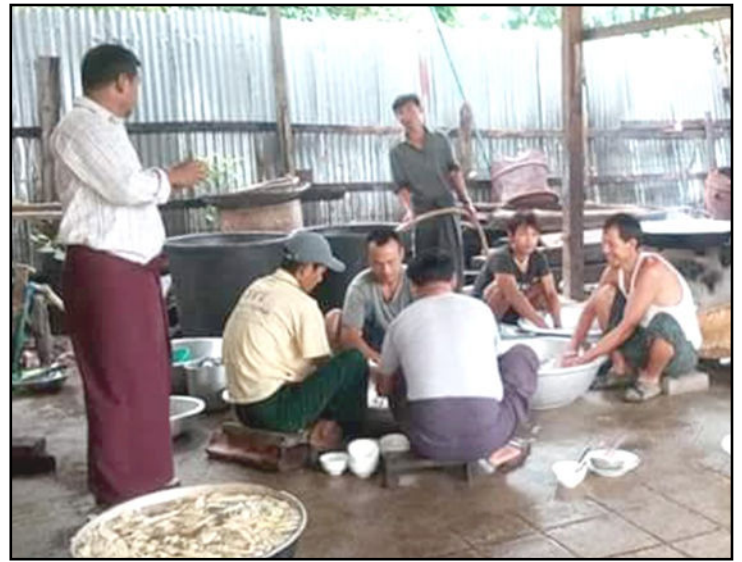
The men are cooking for the Women's Seminar