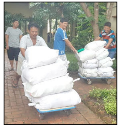
Rice for flood relief through IDES

Generally, 25 or 30 tons of food supplies were distributed. The relief work took us three weeks to finish by 30 volunteers. 1500 individuals of four villages such as Ananbaw, Wai Pyan, Khe Tauk and Se In Si were fed for a month. And, Thousands of tracts were distributed!