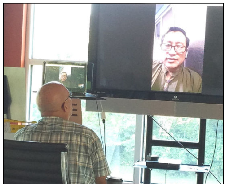
Summer Board Meeting