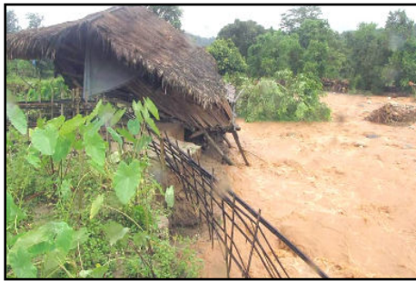
Flooding in Northern Burma

grant from IDES and IDES graciously granted upon our requests. The amount was $10,000 to provide food items and hygiene drinking water etc.... We were more concerned if the contaminated water make infections because of the water for all the toilets were opened up and water was contaminated. Being the whole regions were flooded so all are starving, and even some rescue people from different organizations are dead in the water.