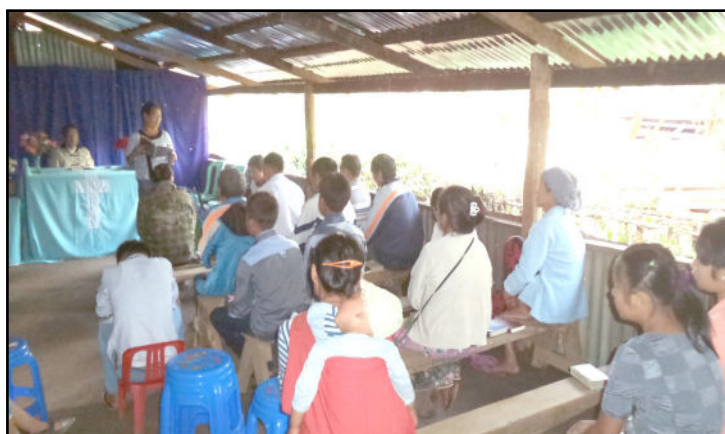
The beginning of House Church

crowded and it becomes too narrow. So, we are very much in need of a new larger church. So, if we could have a new larger church like at May Zele village, we have much possibility to be able to glorify the Lord more. So, I am just simply sharing this need.