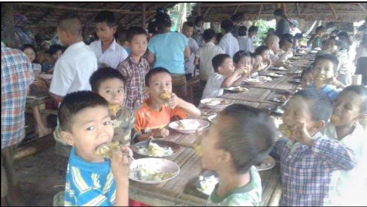
Feeding Refugee Children

REFUGEE RELIEF - God gave opportunity to share food to refugees. Our team taught their children, gave medical care and then they started to ask... "What is a Christian?" And then we know that it is the best time to share the Good News. We sowed the seeds and God makes it grow and multiply.