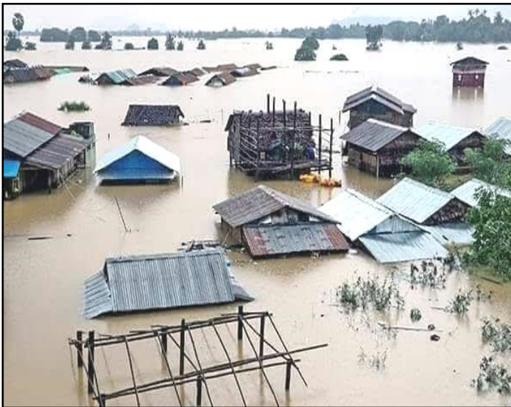
A Village is disappearing in Northern Burma Flooding

As we primarily intended to help our suffering brothers and provide for their daily basic need, we had opportunity not only to provide food but also to witness the love of Christ to the suffering brothers. It was a blessed opportunity to provide food and hope!