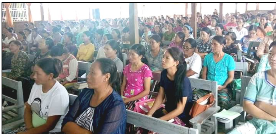
Myitkyina Christian Women's Seminar