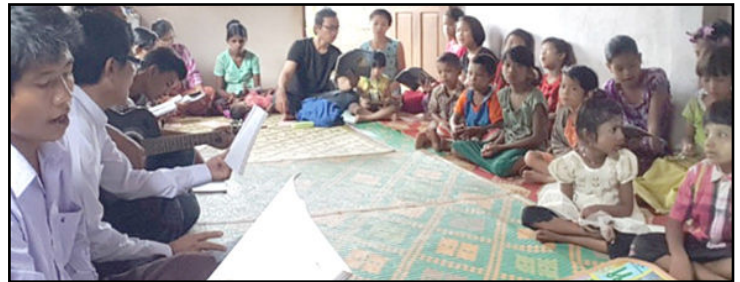
House Church is a Model of Church Planting

House Church is one of the best strategies in Asia as it was in the first Churches in the book of ACTS. All the new converts gather in homes and share their needs, fellowship, worship, Praying, having Lunch as family. This makes warm up to every member and growing in Christ.