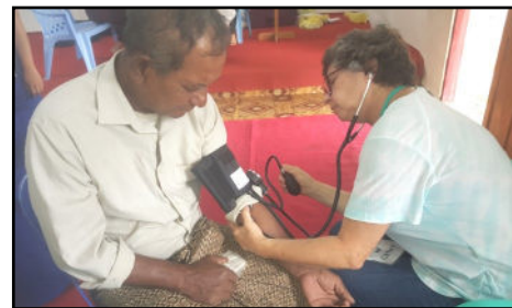
Checking Vital Signs

News... Sowing the Seed of God's Love. Hope and Pray that God Will make it grow and multiply. Keep praying for us as we plan to serve Him.