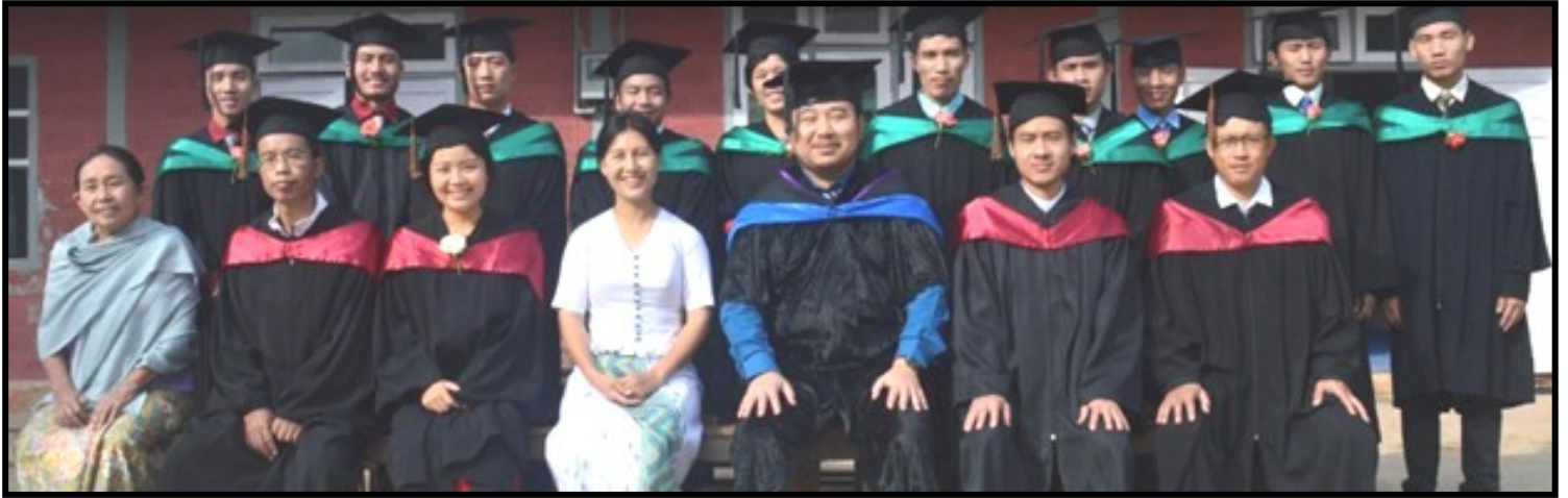
TBC Graduation — December 2022

Greetings from Taunggyi Bible College, Myanmar. I hope that all of you are doing well under God's grace and care. I wish that each day of your life has been filled with blessings, joy, and peace. I'm writing you today to give you updates on Taunggyi Bible College. My staff and I are preparing for the 2023 academic year. And, we have already been contacted by more than 20 potential new students. One of them is a non-Christian young man. God has been good!