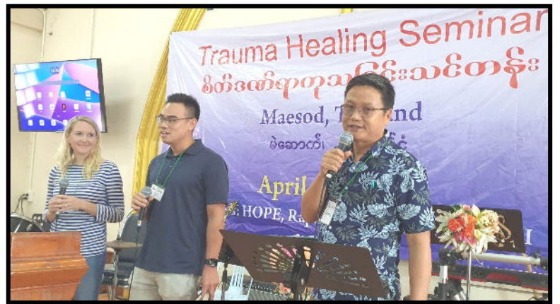
Teaching at the Trauma Recovery Seminar

These seminars were conducted in Mae Sot (Thailand), for dozens of ACS evangelists, Aizawl Mizoram for displaced refugees from Chin State, Myitkyina Kachin State, Mandalay, Magwe, Lashio, and Insein, all locations inside of Myanmar. During three of these workshops, leaders who attended reported their home villages had been bombed by the Air Force while they were away during the week of the seminar!