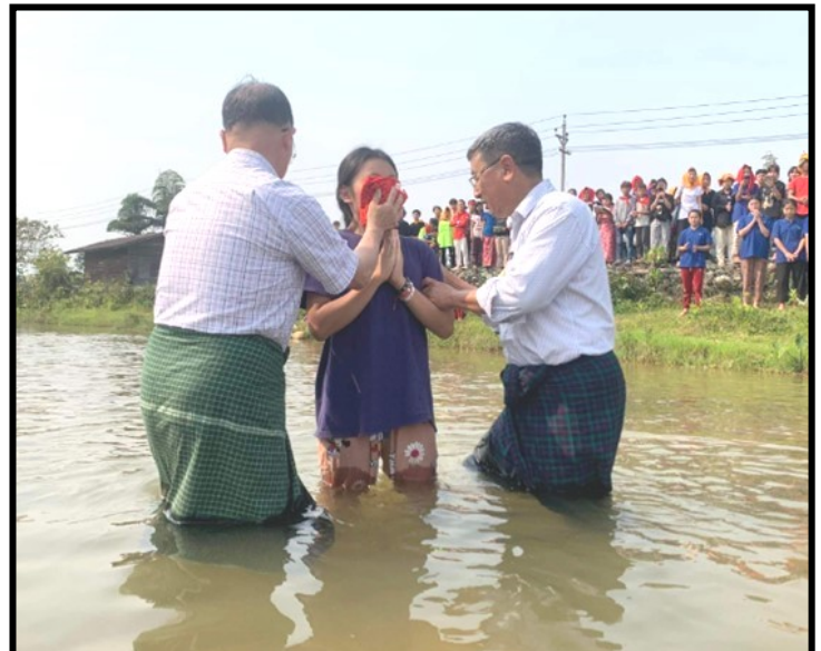
Baptism at Youth Camp

MBI Graduation: We celebrated MBI graduation in the middle of February 2023. Totally 19 were graduated. 17 will go to the ministry. As usual, I challenge them that "How many of you will go to the field right now?" I am so happy that most of them make decision to go to the ministry. Yes, we teach these young people for the extension of His kingdom. Thank you, Lord, for sending these young ones to our college.