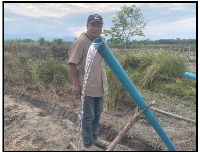
The Reward — Clean Fresh Water