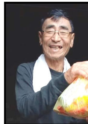
A Joyful Believer

She cared about training leaders. She bought the land for a training center in Naga land, where the people were previously headhunters, but were now “preaching the Word” and winning other tribes. She funded 7 buildings at Taunggyi Bible College. When I went there many years ago, the bamboo housing for the men and women leaked much of the time, so she