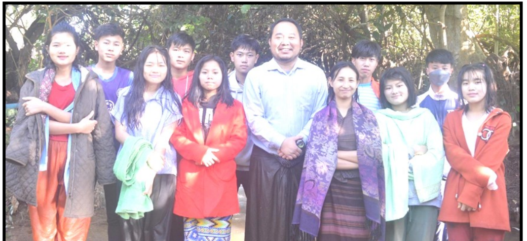
TBC Students Celebrating a New Sister in Christ