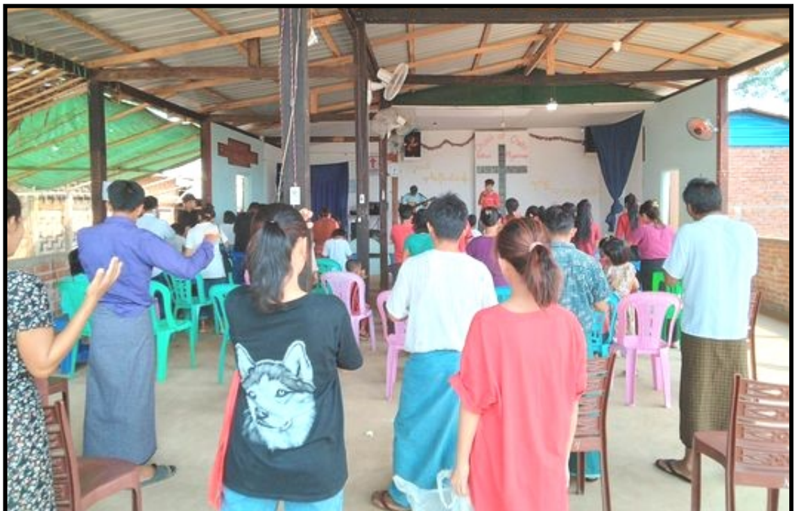
Christians Worshiping while enduring hardship and trauma

We discover that Joseph was able to discern God’s purpose behind all this tragedy, and mentor his brothers into a journey of redemption! What does God have in store for the future leaders of Myanmar....? And how can we best position ourselves to equip, encourage and assist them as they mentor their brothers and sisters along this same path...?? Thank you for supporting ACS in this unfolding journey of redemption as our local ACS evangelists and church leaders prepare for the next phase of ongoing ministry!