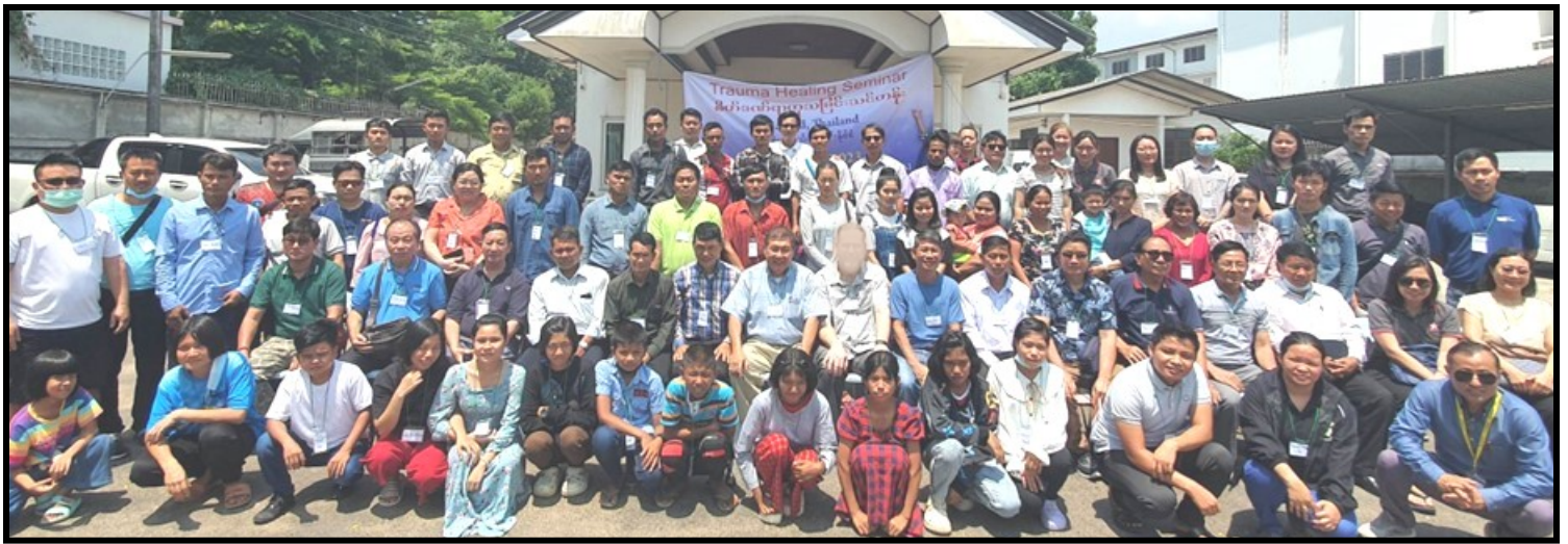
The Trauma Recovery Seminar

These seminars were conducted in Mae Sot (Thailand), for dozens of ACS evangelists, Aizawl Mizoram for displaced refugees from Chin State, Myitkyina Kachin State, Mandalay, Magwe, Lashio, and Insein, all locations inside of Myanmar. During three of these workshops, leaders who attended reported their home villages had been bombed by the Air Force while they were away during the week of the seminar!