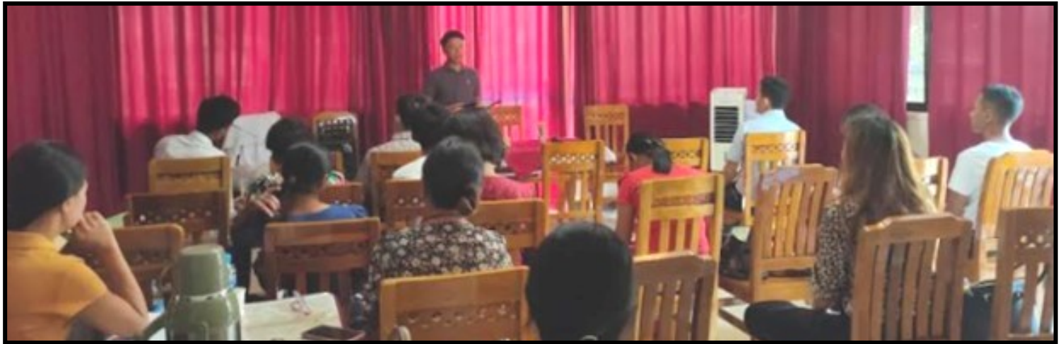
Zume Training in the Capital of Mon State