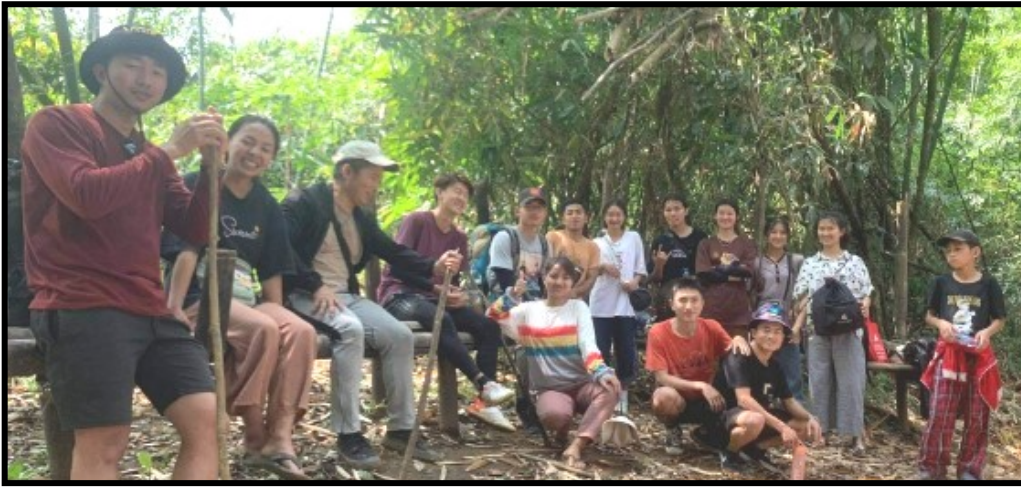
The MBI Students on Summer Mission