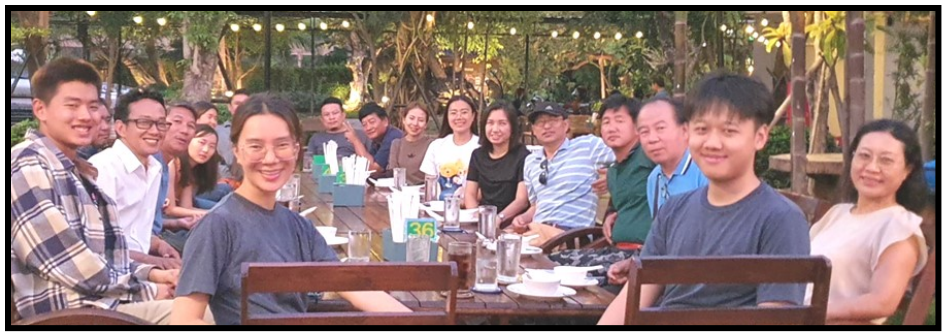
Fellowship Eating Together

The first week in April was the first chance in almost 3 years that a gathering of evangelists came together face to face along the Myanmar/Thailand border in Thailand for training, encouragement and fellowship. All of them had been working primarily alone during that time with any connections with others coming only via the phone or internet. Evangelists and missionaries, including most of their spouses, participated in this event. It was a spiritually filling week of blessing for them. Worshiping together, scriptural teaching, a seminar on Trauma Recovery, watching the Jesus Film along with receiving the training and a computer tablet to use the Jesus Film in evangelism made up the week. They also received backpacks of medical supplies with the training to use the supplies. Eating together and storytelling filled in the cracks and made the time together refreshing.