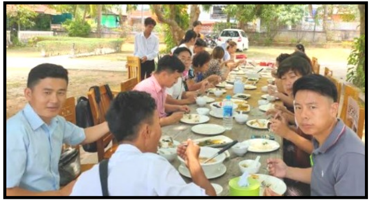
Zume Training Meal Time

Zume is the Greek word for yeast. It is an internationally used video training curriculum to help evangelists become disciple making reproducers. It is DMM (Disciple-Making Movement Training). ACS has sponsored this training several times via Zoom calls with both USA and Asian leaders working together. Now it is being taught in Myanmar in Burmese and Mon. This time the training is sponsored by TEAM Expansion from Louisville, Kentucky. We are grateful for their partnership.