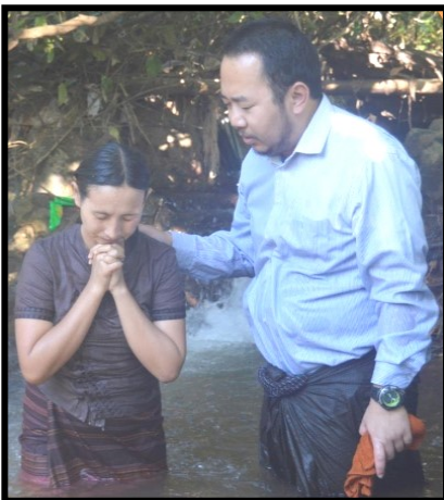
First TBC Student to be Converted and Baptized at College