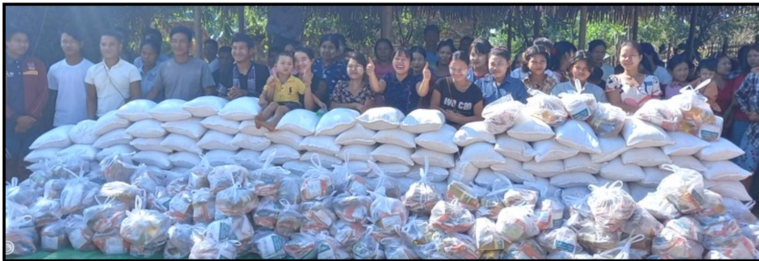
Distribution of Food

On Mother’s Day Typhoon Mocha added to the chaos, bringing 155 mph winds and a 45 ft storm surge into the low-lying areas of Rakhine, Magwe, and Chin States. Again, there really isn’t any reporting infrastructure in place, and much of the flood zone lies outside the government control area, where various ethnic armies set the rules – so estimating casualties is difficult. But as reports trickle in, it is conservative to estimate fatalities of several hundred, and displacement (destruction of family shelter) of at least ¾ million people. Crops were destroyed, and most livestock drowned. Distribution of food, medicine, water filters and tarpaulins has become top priority for saving lives.