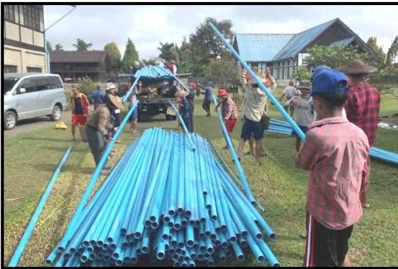
Collecting the Pipes

Water Project: As we are always seeking a good relationship with local churches, we normally do some social reform works with them. Accordingly, we did a water project in Ziwun village. We provided them water PVC pipes and all other equipment. Finally, they got a very clean water.