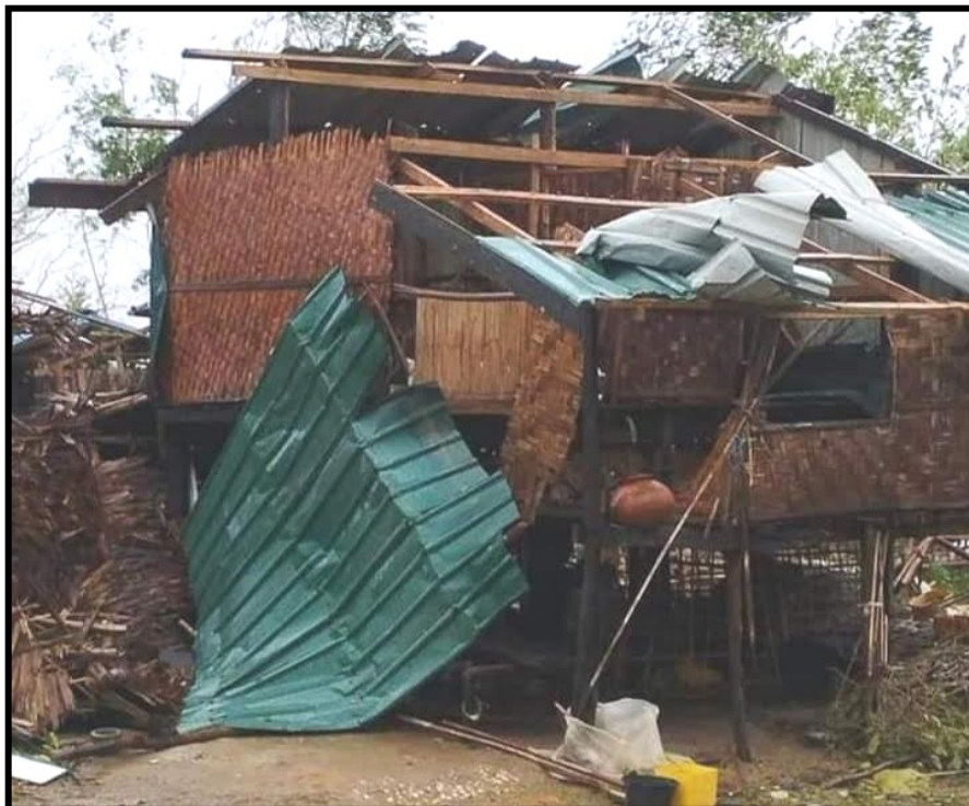
Cyclone Mocha Damage

Myanmar has been overwhelmed with trauma for the past three years. We call these the “4-C’s”: Covid, Coup, Civil War, and now Cyclone Mocha. During the covid crisis, Myanmar was crippled by lack of hospital capacity and social reporting infrastructure. During the earliest phases of covid, India made global headlines because of the staggering death rates – but Myanmar undoubtedly matched