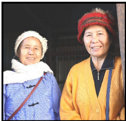
Joyful Believers in Myanmar