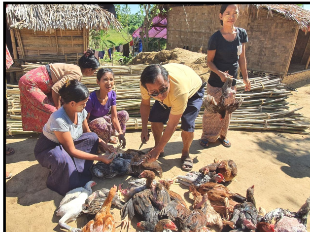
Distributing new chickens