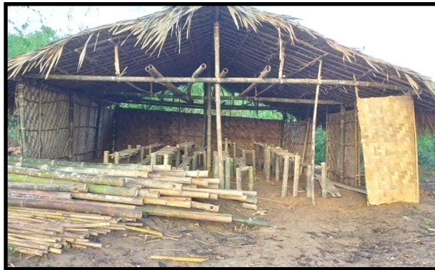
New Refugee School Building

Our team is applying Family, Personal Evangelism in this pandemic time. We reached and baptized 15 new converts in this quarter.