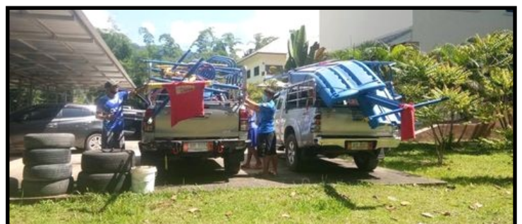
The playground being delivered