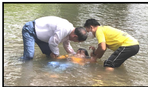
Refugee girl being baptized