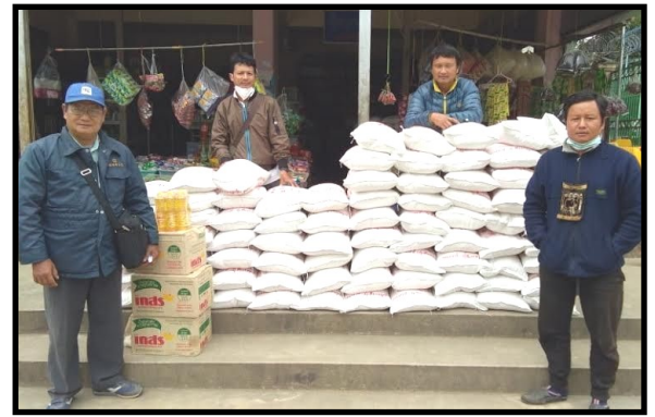
One distribution site