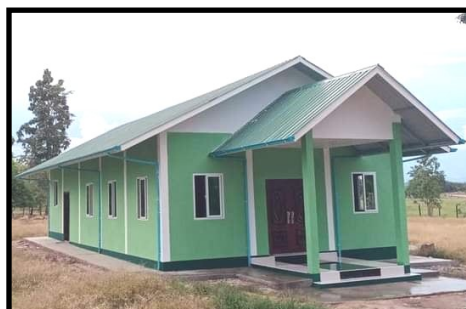
Myatlay Kone Christian Church