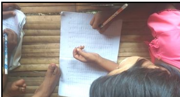
Refugee children doing schoolwork