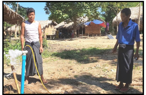
Fresh water from a new well

Fresh water is one of the great needs. We were able to Drill 7 Wells for refugees and villagers.