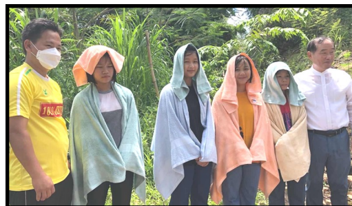
New baptized sisters in Christ