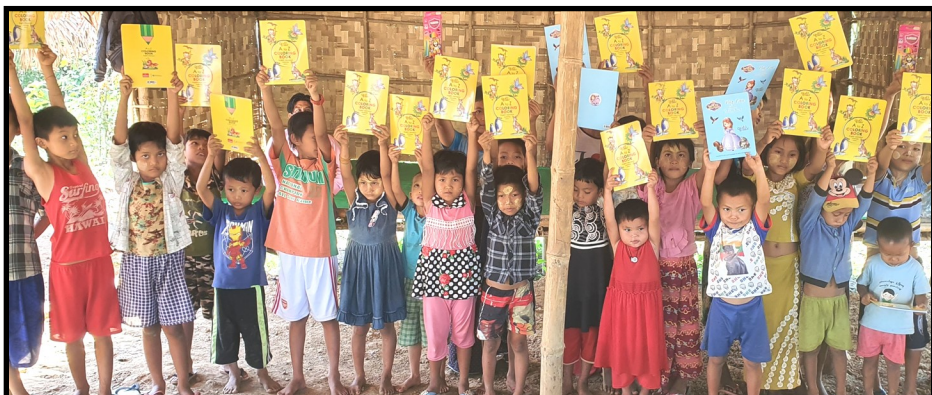
Children enjoying school