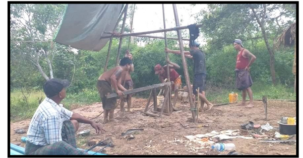
The drilling team at work