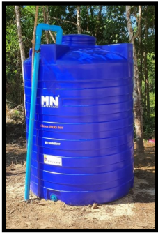
New well and clean water tank for Refugee Camp