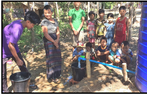
Life giving water