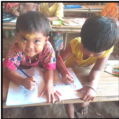
Every child needs to hear about Jesus

Through these difficult times, hope has been brought to thousands of people! During the pandemic many huge outreaches by our Asian Missionaries, aided by partners – IDES and FAME – have helped people in their most ailing needs. Along with these deliveries of food and medicine came the sharing of God’s love by teams of ACS workers.