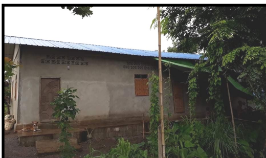
Three Pagodas Christian Church