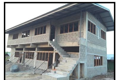
Immanuel Christian Church