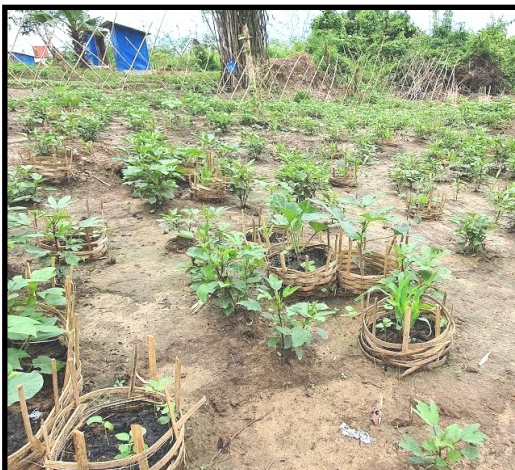
A new refugee garden

"You will be made rich in every way so that you can be generous on every occasion, and through us your generosity will result in thanksgiving to God. 2 Cor. 9:9,11.