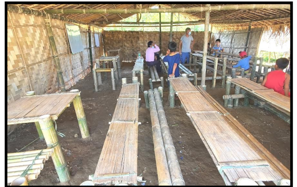
School Classroom with desks

“For the Son of Man (Jesus) came to seek and to save the lost.” Luke 19:10