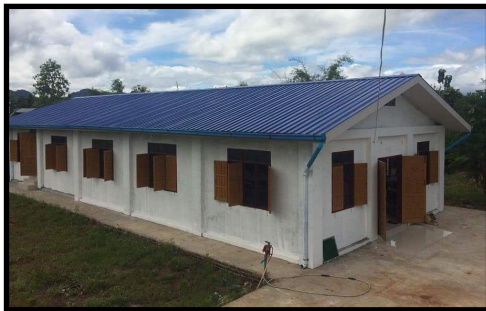
Grace Christian Church

But God wasn't finished. In 2018 we begin to pray and discuss how God might use this partnership in other ways. What came out of