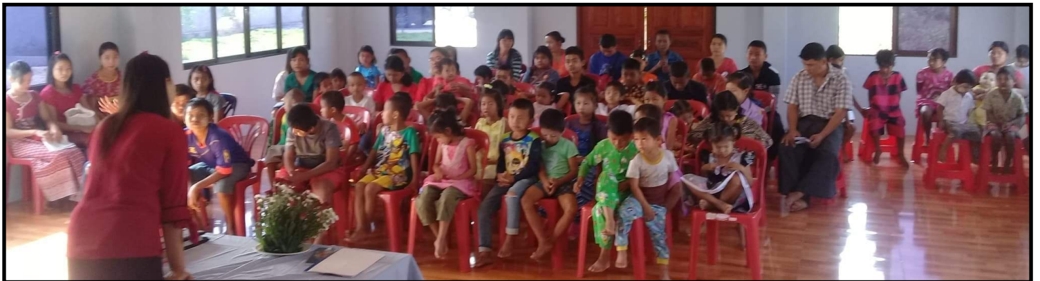
MaeSot Christian Church