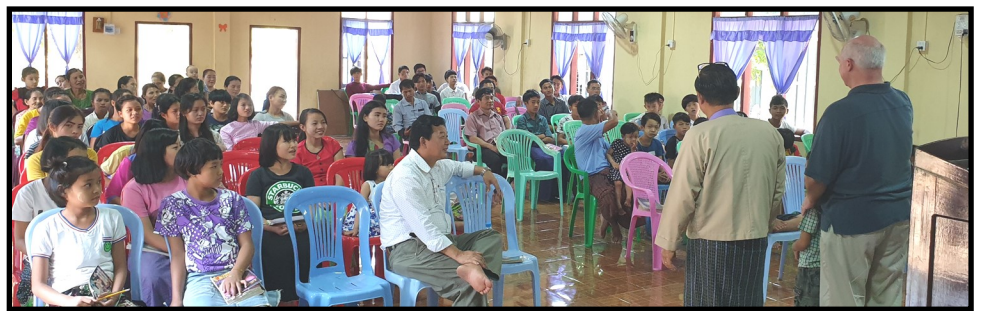
Hope Christian Church