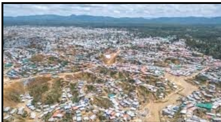
Cox Bazaar Camp