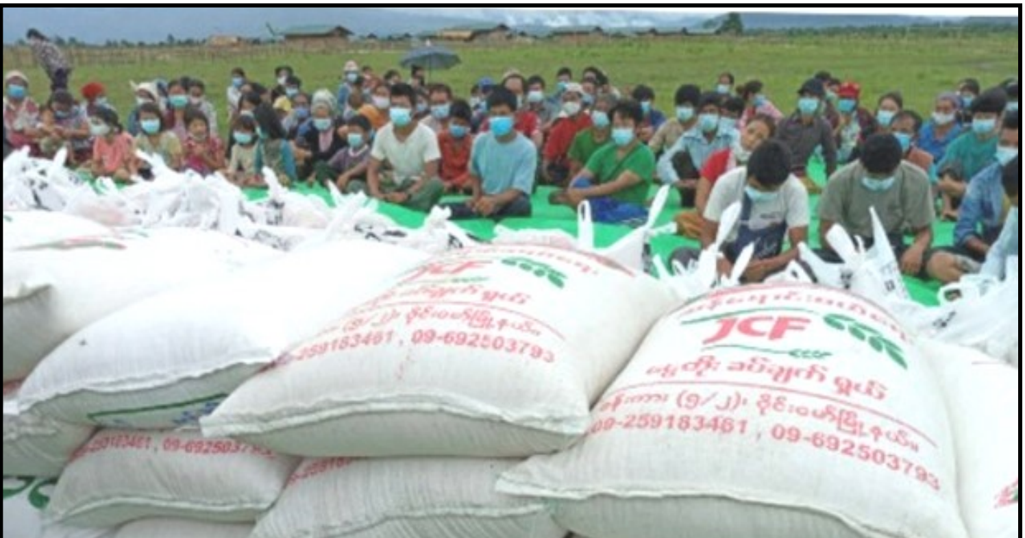
Meeting the Needs of Many