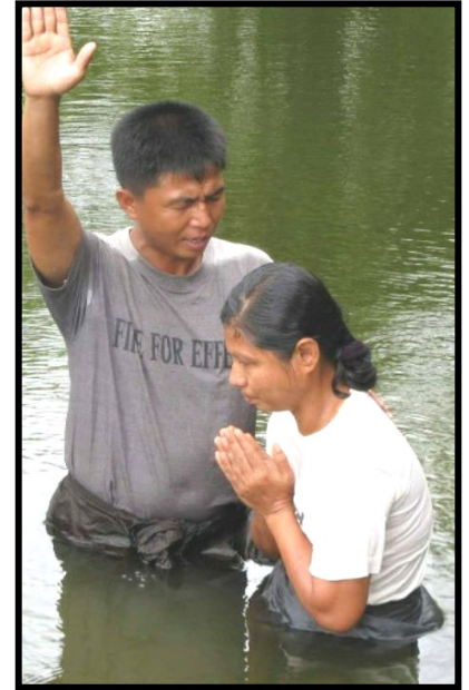
A Lost Sheep is Found

This is obeying the Great Commission of Our Lord Jesus Christ. Our team reached and baptized 26 souls in this quarter.