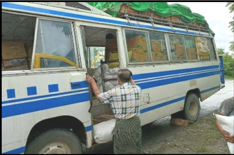
Relief Delivery by Bus

Your fellow Laborer in Christ's Service, - Simon & True Family