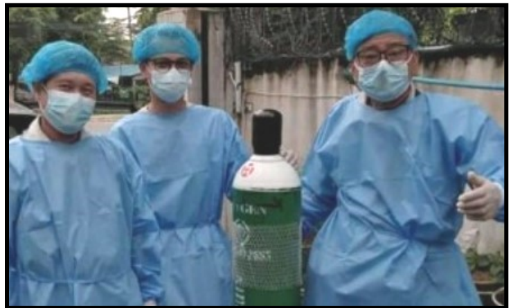
Covid Medical Relief

Medical care and Prayers are the key to heal their physical, mental and spiritual sickness.