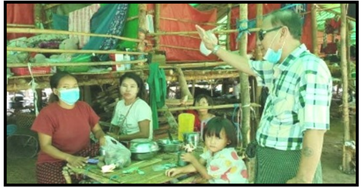
Giving Thanks for God’s Provision