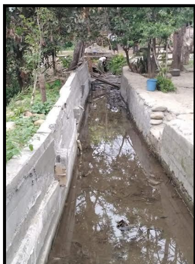
Retaining Wall Completed

Timothy said that since the retaining wall is done, the villagers will have many benefits. The village will be free from the flood and also the villagers can start growing paddy over 100 more acres from this year since there would be no more flooding from this year on. He said there is still much virgin land which can be changed into paddy fields in the