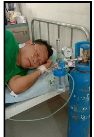
Covid Patient Oxygen Relief