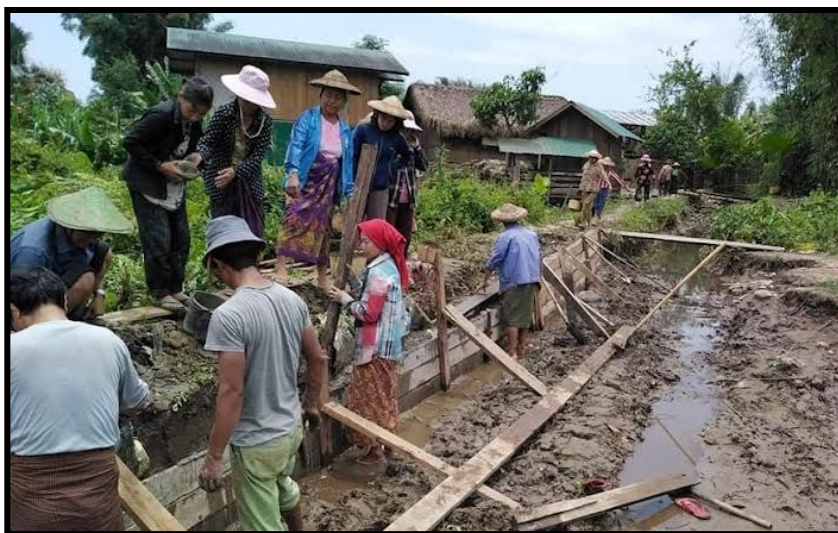
The Villagers Working Together

He also said, “If they get the funds, the labor can be done by the villagers. He said that if they have done the whole retaining wall, the villagers would be free from the flood and over 100 acres of the paddy fields could be irrigated, and it will benefit over 200 families (over 1000 villagers). Moreover, the Khamti Shan who are Buddhists will be also touched with the love of Christ.