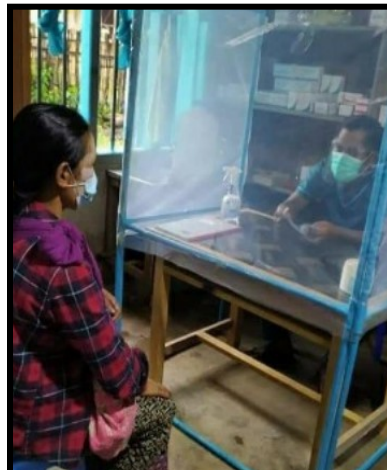
Mulashidi Covid Center