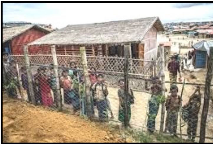
Children in the Cox Bazaar Camp