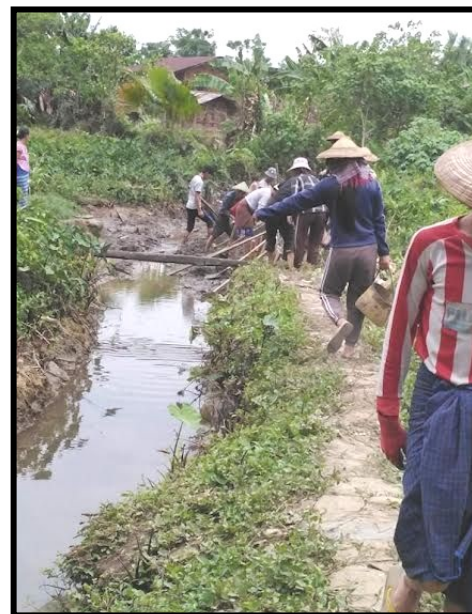
The Irrigation Canal