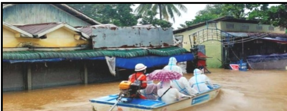
Flood Relief in Covid

We are suffering CCF triple disaster: Coup, Covid, Flood and living in unsafe situations. This is the darkest days and there are shooting, bombing, violence daily. The people are hopeless, helpless, and struggling hard for life in this pandemic time.