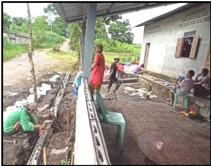
A New Outside Wall for Security