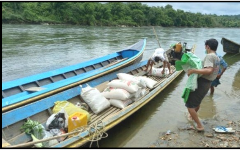
Relief Delivery by River Boat