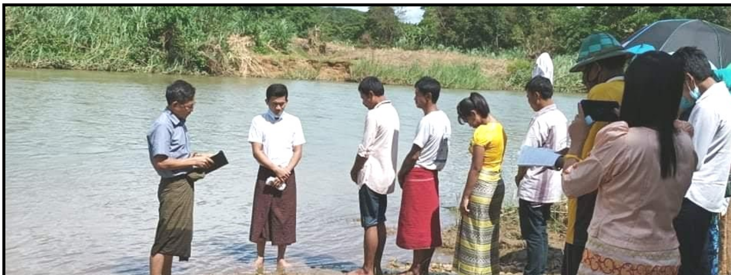
Four New Believers

It's always a joyful heart to share with you about how God is doing great things in His ministry and extension His created people. Today, on September 4, 2021, the Lord brings four new souls. They accepted Jesus as their personal Savior and