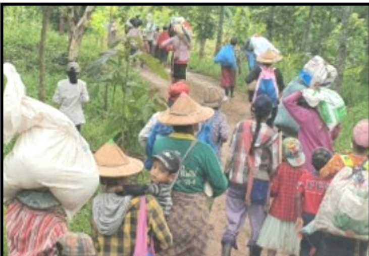
Refugees Returning to the Jungle with Food