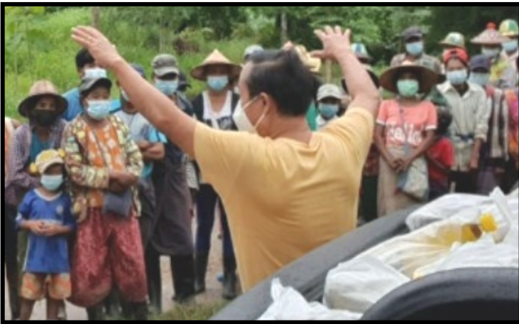
Praying for the Refugees

In the midst of hardship, wars, Covid-19, natural disasters, and poverty, we aim to love people, share the Good News, the living Hope in Christ and transform their lives.