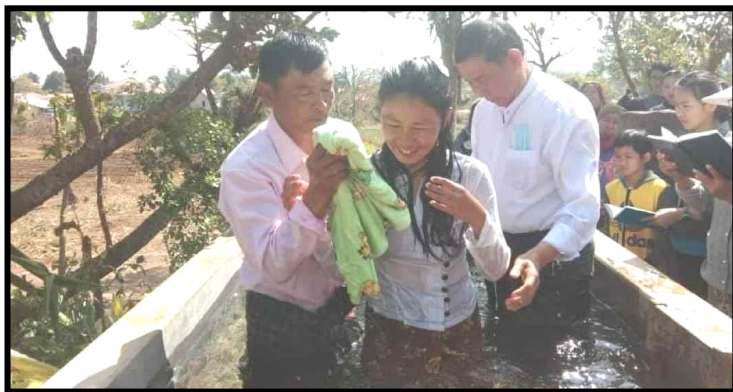
Baptism of New Believer

This past month August, we received a grant from IDES. Since before we do this project, we tried to reach out many of our new friends who are unbelievers. Two were baptized during this project week. I am so happy to serve the Lord because I have been able to add a little salt to our neighbors through this project.