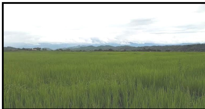
Paddy Field is Flourishing

He told me that even the widows and orphans are so happy that they are saying that they didn't get enough rice last year but this year, they will have enough rice to eat because of the retaining wall. It is right that our small donation makes a huge difference in the villagers' lives. They are very happy to have a good harvest this year. Thank you very much. God bless you.