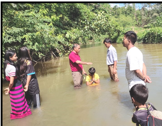
Baptism of Animist Worshiper

Thank you for your support in both your prayers and financial gifts. The gifts we give seem to be like the loaves and fish that Jesus used to feed the 5,000. The Lord seems to multiply their impact beyond what we can imagine. As you read this edition, may your own heart be strengthened so that you too, can persevere through the suffering you are experiencing. That perseverance will lead to a change in your character and give you hope!