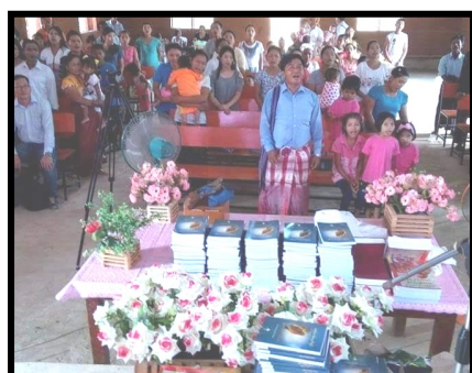
Celebrating the New Hymnbooks