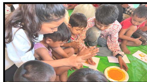
First Time Making Hand Prints