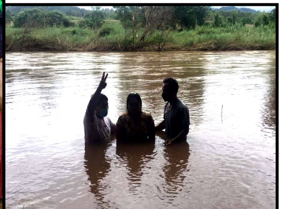
Baptism of Ancestor Worshiper