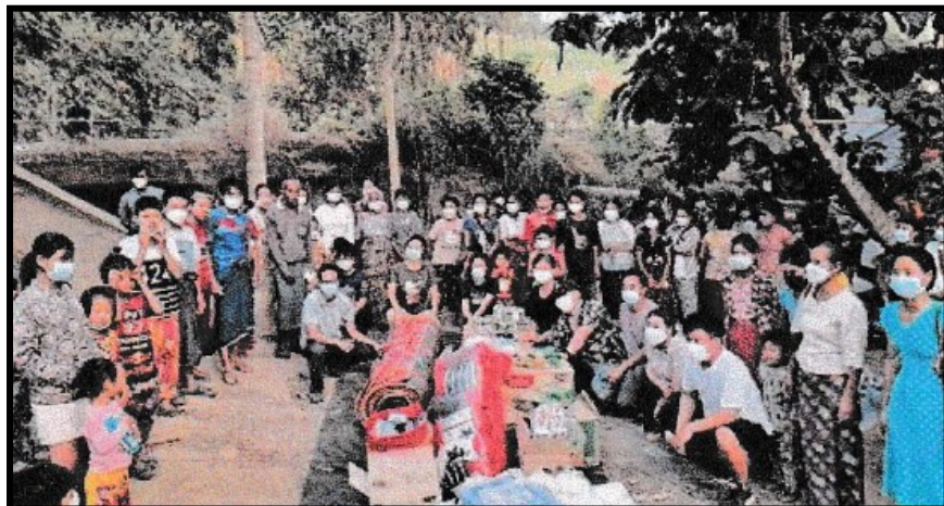
Refugees at the Myanmar/Thailand Border