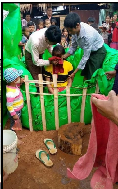
Baptism of Buddhist Refugee