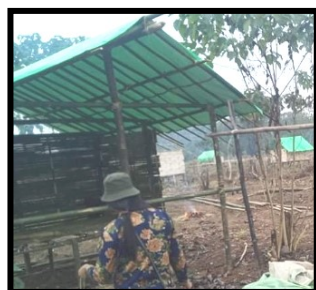
Tarp Roof Home of Refugee