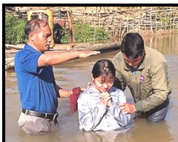
Paul Baptizing New Believer