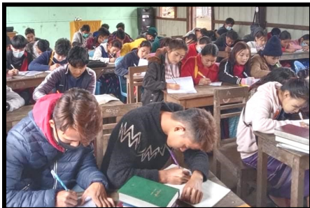
Bethany Students in Class