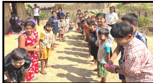
Playing in IDP Camp