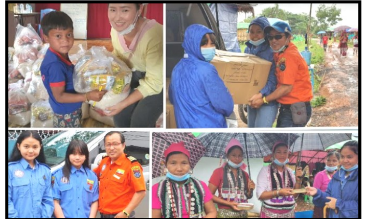
Simon Family Outreach