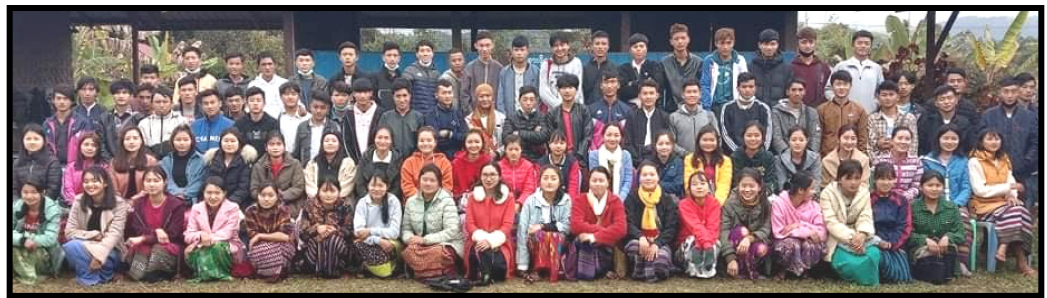
Bethany Bible School Students and Professors