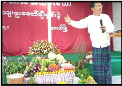
Zame—Celebrating Feast of First Fruits

Church must fight against evil spirits and the people need to be taught to use the power of the Gospel. This new church recently celebrated THE FEAST OF FIRST FRUITS. It was a wonderful celebration for them. They are trusting God more and more.