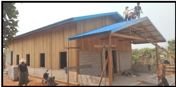
New Keng Tung Church