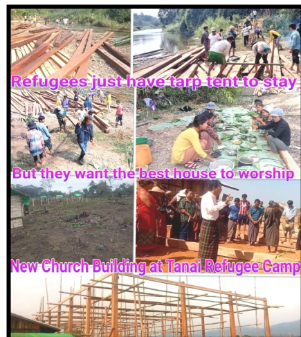
Building a Church in the Refugee Camp

We have free lumbers, and the refugees are volunteers to build this church. We are building this church from the the contribution of Bring Good News International . The donation is building a 40 X 60 church building. The refugees are volunteers, giving free labor and saw the lumber to prepare church building. They are dedicated, leaving their huts, tarp tents and work the best for the church. The refugees are very poor but rich in spirit. They want to build the best house for the Lord to worship even though they are living in hut with tarp roof. We still need US $1,500 for zinc roof sheets instead of tarps. Hope and pray that God will provide. Blessings. - Simon